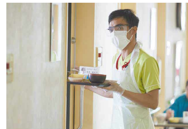
Preparing lunch and assisting facility residents with meals.

They adapted quickly to their new workplaces, and I have no worries about recruiting foreign workers.