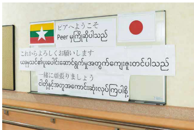
A welcome message in Burmese in the entrance hall!

Myanmar people seem a little shy. I think the facility users found them easy to get along with, because they are similar to Japanese people. They are very diligent and quick to learn their jobs as well as Japanese. They can even understand the Tokushima dialect now, and communicate with facility users without any problem. They seem to have settled into Tokushima, and this summer, they went to the Awa Odori with their Myanmar friends. Although they don't have many opportunities to visit tourist spots in Tokushima as the result of restrictions imposed on travel due to Covid-19, I hope we can go sightseeing together one day.