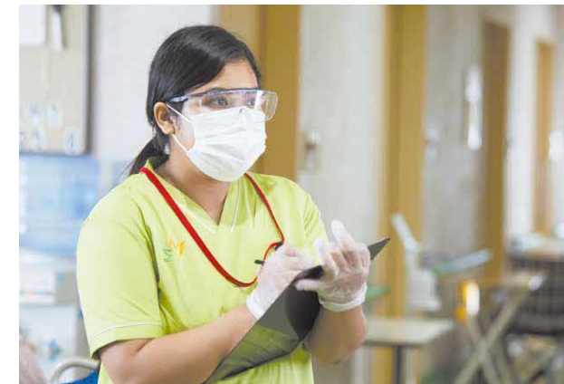
Checking the day's schedule in Japanese during the morning meeting.

Moving forward, the goal is to train them so they can work night shifts too. I want them to improve their Japanese writing skills, so they can keep records. They are apparently aiming to become certified care workers, so I hope they do their best to acquire the qualifications. We are planning to hire more foreign staff in the future, and I am looking forward to seeing them play an active role as the leaders of new overseas employees.