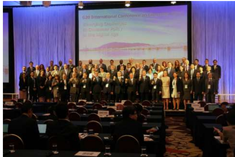
G20 International Conference on Consumer Policy, Sept. 5-6, 2019