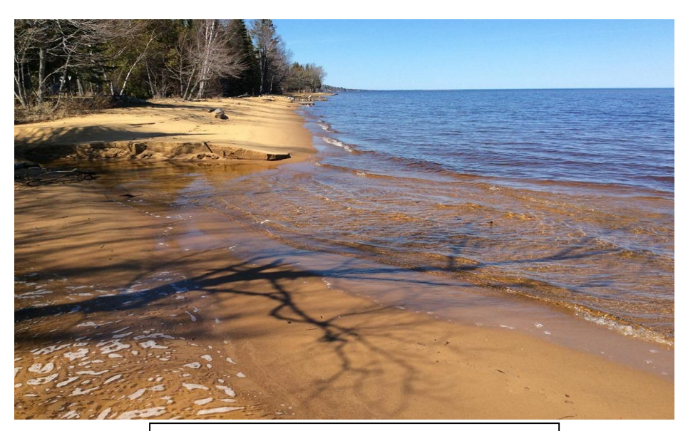
One of Michigan's Many Lakes