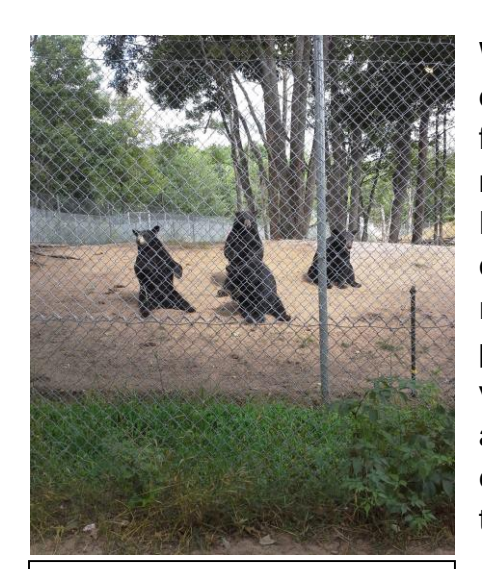
Bear Sanctuary in the Upper Peninsula

While both peninsulas make up Michigan, there are some distinct differences between them. The land of the Lower Peninsula is flatter than that of the Upper, and the Lower Peninsula is also much more urban. While the largest city of the Lower Peninsula, Detroit, has a population of roughly 670,000 people, the largest city of the Upper Peninsula, Marquette, only has a population of roughly 20,000 people. The Upper Peninsula is a much more rural place, with small towns and vast nature. As such, there are also a variety of interesting wildlife that live in the Upper Peninsula such as bears, moose, coyotes, wolves, bobcats, otters, etc. There are even places such as a bear sanctuary where you can see some of these bears for yourself and feed them apples!