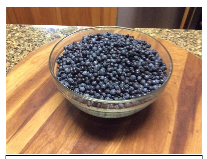
Blueberries Harvested in Michigan

With all of these agricultural products, it should be no surprise that Michigan also has one of the highest number of local farmer markets in the nation, which are always packed with fresh, locally grown produce. Some are even open throughout the entire year.